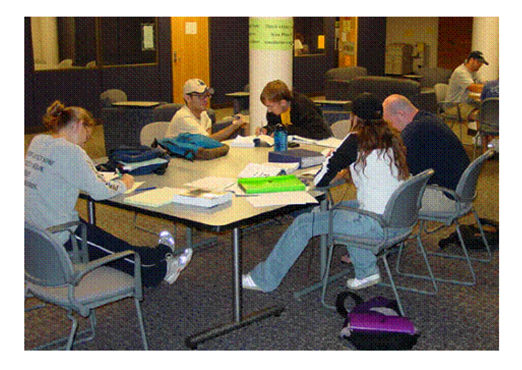
This picture illustrates teamwork and collaborative learning that happens as a result of some of the new activities at SIUC in the first year.

The Engineering Residential College comprises the foundation of our new living-learning community for engineering students and consists of three residence halls in a premium location on campus; they are designated engineering-only buildings where students have easy access to student support services (e.g., tutoring and peer mentoring) and can become part of a supportive peer network and community of learners. First- and second-year students in the College of Engineering are required to live in the Residential College. Evening tutoring sessions occur four nights per week, three hours per night in math, physics, and chemistry courses. The goal is to facilitate increased grade point averages and limit preventable failures by students.